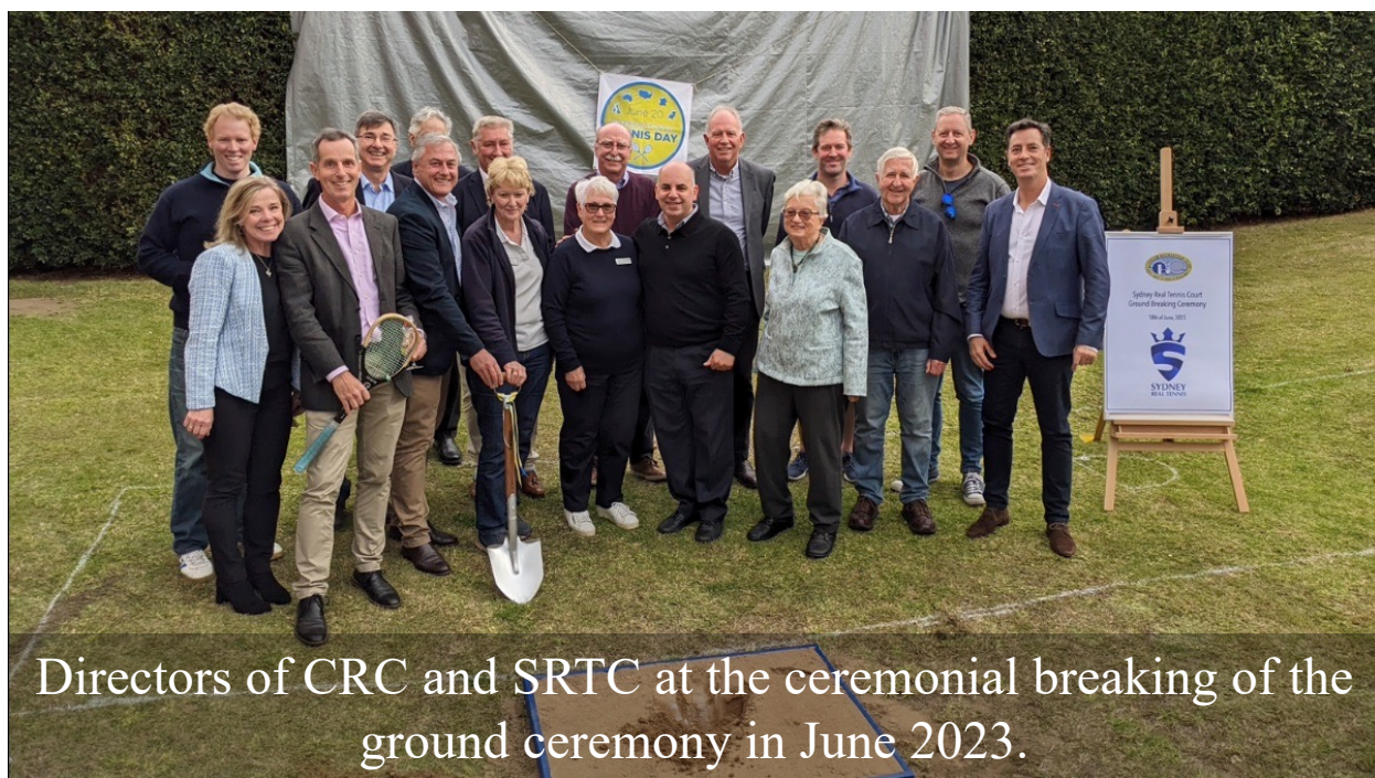
Directors of CRC and SRTC at the ceremonial breaking of the ground ceremony in June 2023.

Pictured below are the directors of CRC and SRTC at the ceremonial breaking of the ground ceremony in June 2023.